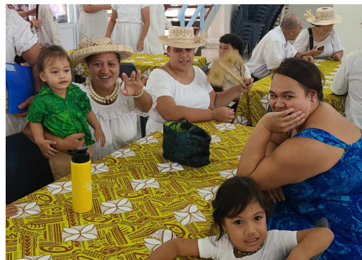
Pictured L to R is the food that has been prepared and cooked. And the Matavera Sunday School children enjoying.