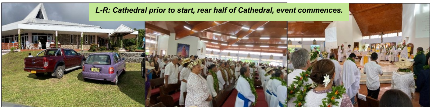
L-R: Cathedral prior to start, rear half of Cathedral, event commences.

Well how can one continue to be stubborn in front of heaps of people, so I got up and reluctantly went along with the innocent and good-mannered attendant to the front. A couple of seats in front of me sat the KR, PM, Ariki's, NZ & Aust. Representatives, and other notable dignitaries. I said to myself, Thank goodness I'm not sitting with them, otherwise we'd be talking politics! But before long, other supposedly VIPs also joined me, escorted over by the attendants. The thought then came to my head, Now people can clearly see that we're VIPs! Hopefully they have the same interpretation of VIP as Very Important People rather than Very Ignorant People . The last thing I wanted on the day was to be in the latter category!