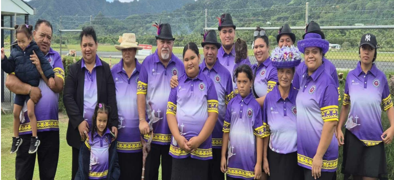
First flight Group that departed Rarotonga on Friday the 7th.

I was privileged and honoured to have been part of the Ruatonga group whom travelled to Mangaia for this bicentennial celebration. Even more special to have my grandmother with me. We were a team of 39 including our elderly women and children. For most of us this trip was our very first-time setting foot on the island; and for the rest of us, it's their first trip back home for a very a long time, which made this trip extra special, even for my Nena.