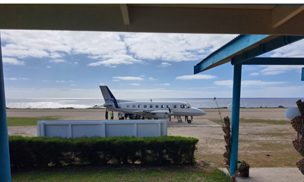
Our flight preparing to depart Mangaia for Rarotonga.