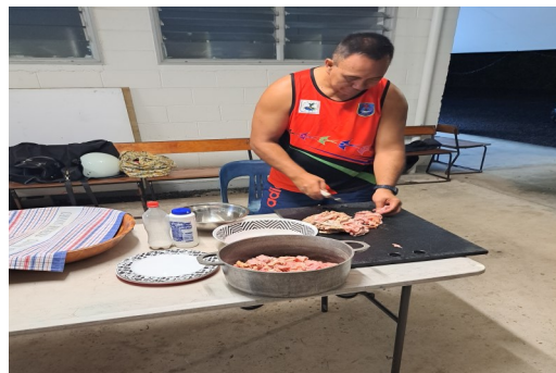
Pictured L to R Avatiu Ekalesia prepping for the Sunday Lunch, hosting the Sunday School children from Matavera.

Food prep started also, the defrosting and slicing of meats, and chopping up vegetables and other ingredients required for the feast the next day. Before the night ended, we shared and enjoyed a meal together, with a pot of roto puaka (Pigs innards stew) with a cuppa tea, coffee and biscuit. Everyone headed off home before a scheduled black out or power cut was about to commence.