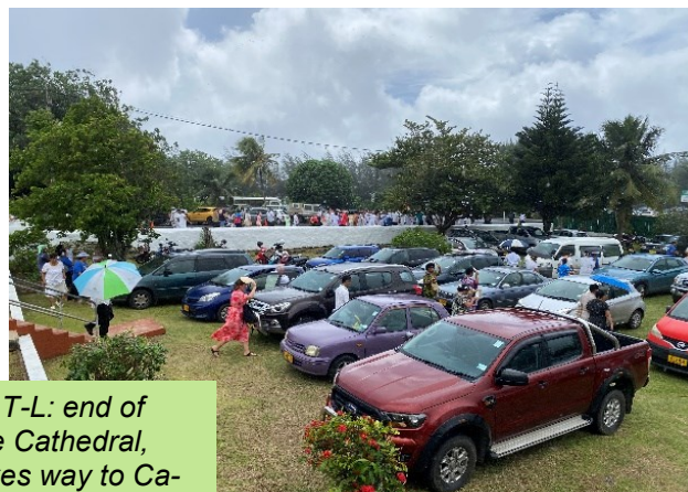
Clockwise from T-L: end of ordination at the Cathedral, procession makes way to Cathedral basement hall for short break, arrival at hall, with my friend Paul, retiring Bishop.