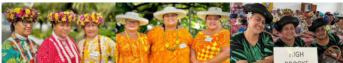
From Left to Right are delegates from Tahiti, Atiu and High Brooke Ekalesia's.

Kua manea e kua mataora tikai te au anga’anga a te uipa’anga Vainetini. Kia akameitaki’ia te Atua no teia ati’anga manea tei rauka, kia taokotai akaou te Vainetini i te uriuri i teia au manako puapinga tei rauka i te akamaroiroi ia ratou rai te iti vaine. Tapati ra 2 no Tiunu , kua topiri ia te Uipa’anga Maata a te Vainetini i Arorangi i te ora 2 i te aiai. Ko te tuatau openga rai teia to te iti vaine taokotai’anga. Ka tapapa atu i te Uipa’anga Maata a te Vainetini i te Mataiti 2026.