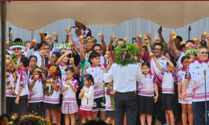
Lighting of 200 candles on a cupcake, marking 200 years of the Gospel to Mangaia.