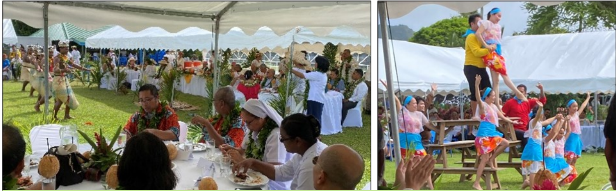
Groups from the local diaspora communities: Kiribati (left), Philippines (right) and Fiji (below).