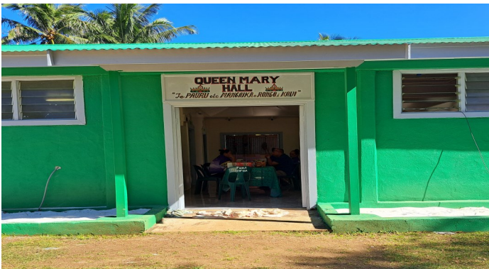
Queen Mary Hall or Kuramoemoe Hall

transported directly to our accommodation Queen Mary Hall also known as Kuramoemoe in Ivirua.