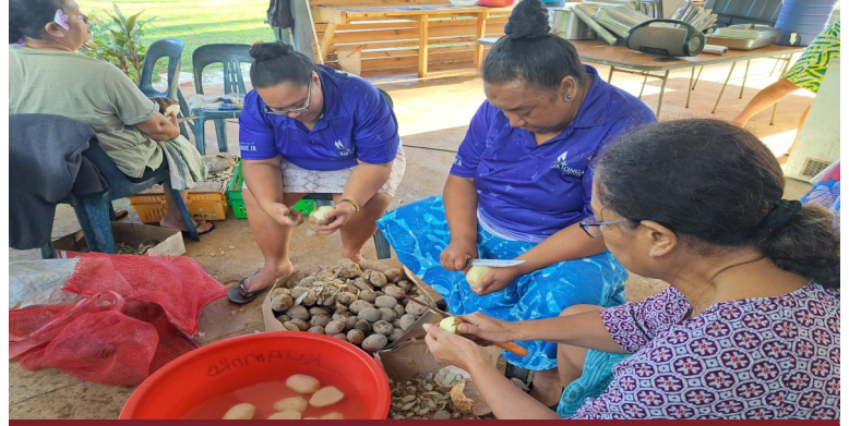
Our Ruatonga Mama's peeling Potatoes.

On Friday the 14 th , was also a free day as well, however, our Ruatonga group was asked to host the Ivirua community dinner for that Friday, as the Ivirua community were part of the production show that was displayed later in the evening of that day. So, we happily took on the challenge of being chefs despite half of the team following bus tour of the island, which surprisingly went well and successful.