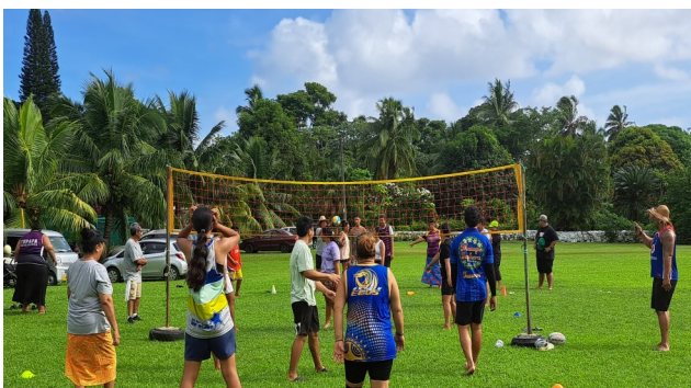
Avatiu, Ruatonga VS Tupapa, Maraerenga, Volley ball. Mapu.