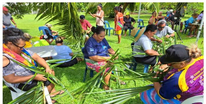
Tupapa, Maraerenga, e rangaranga nei i ta ratou, pare ukarau, apuka e te tapakau. Ekalesia.