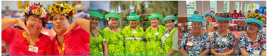
From Left to Right are delegates from Avarua, Nikao and Arorangi Ekalesia's.

Kua akamata atu te iriirikapua i te Monite ra 27 e te Ruirua ra 28 o Me , kua rave iatu teia akakoro’anga ki roto i te