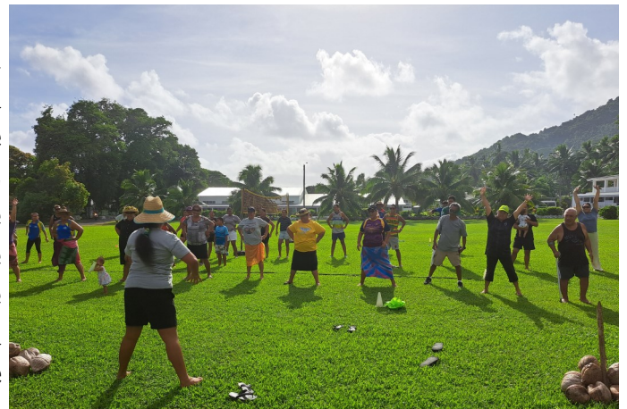
Warm-up, akauka style. Arataki ia e Ati Tereu.

Kua akatu'anga ia e toru pupu; Ko te Tapere Avatiu e Ruatonga, Tutakimoa e Takuvaiane, e pera Tupapa e Maraerenga. Kua akamata to matou ra na roto i te akaeta uaua (warm up) tei arataki ia e Ati Tereu. E kua akamata matou i te porokoramu mua koia ko te patupatu poro (volley ball), aru mai i te reira ko te ko akari, te rangaranga pare ukarau, apuka e te tapakau e pera te peipei tiporo. Kua rave katoa matou i te tu'anga o te oro tukutuku rakau(relay) e te putoto taura (tug of war), tei akatakake ia na roto i te Apii Sabati te Mapu e te Ekalesia.