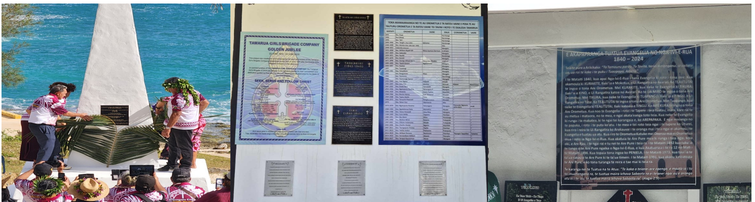
Pictured L to R are some of the plaques unveiled in Oneroa, Tamarua and Ivirua.

We attended the Oneroa Day on Monday 10 th , Tamarua Day on Tuesday 11 th and Ivirua Day on Wednesday the 12 th . During these three days, plaques and commemoration stones were unveiled to mark the arrival of the gospel to Mangaia and furthermore spread into the three villages on the island.