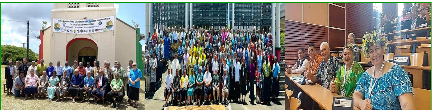
Pictured above is the CICC delegate representative at the PCC 12th General Assembly.