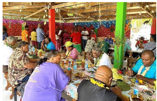
Church leaders being welcomed by one of the local villages on Lifou, snacks time.