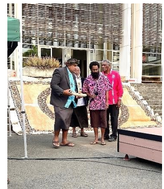
Opening of assembly outside lecture hall, University of New Caledonia, Noumea.

PCC Article Submitted by the Following People: