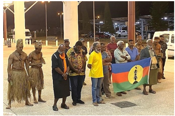
Delegates arrive Noumea, Thursday evening 16/11, welcomed by Kanaky traditional leaders.