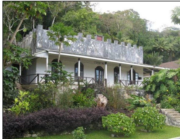
Lecture Hall, Takamoa Theological College, 1919.