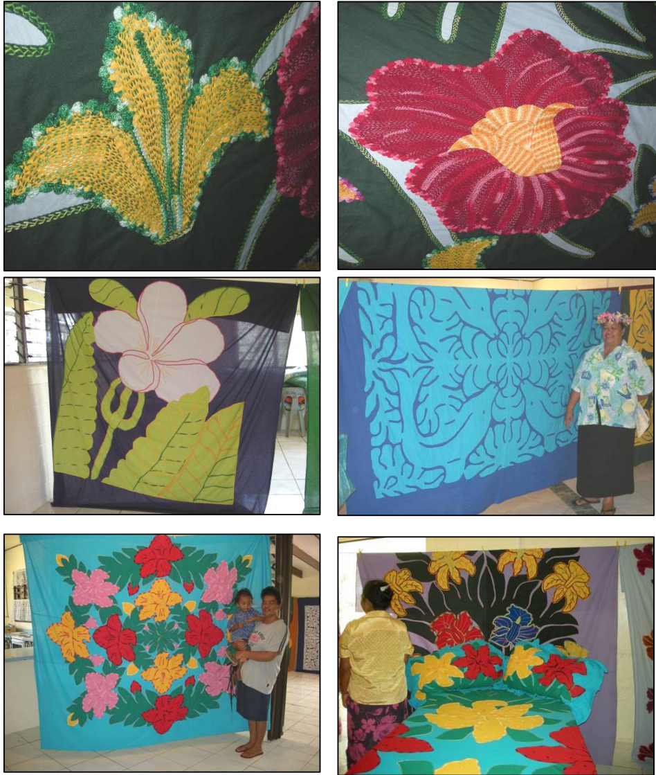
Ko tetai teia o te au akaariarianga tivaivai a te au mama o Vaipae.