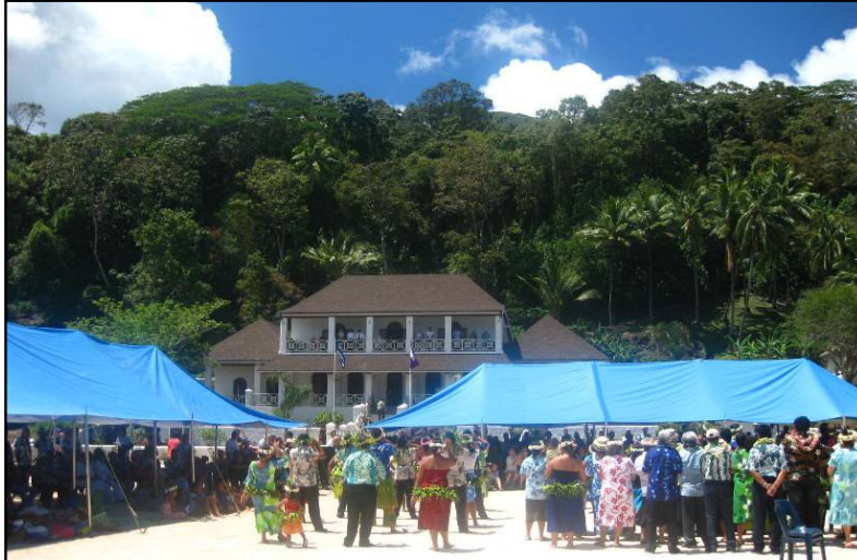
The marquees are up for the combined dedication of the renovated Mission House, and the national gospel day, October 2009.