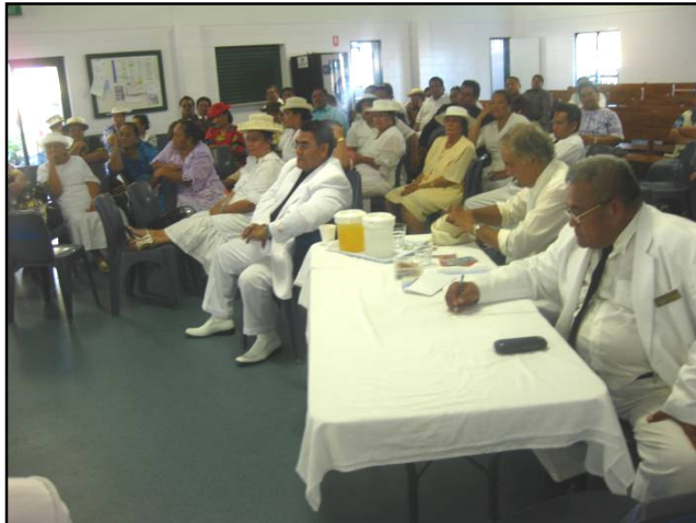
(Combined uapou by Mt. Sheridan & Balaclava, Sunday 15 November)

I te tere i Cairns, kua rauka tetai koikoianga tuatua mei nga metua mai o te Evangelia tei noo ki reira, tena to raua tua tapapa tei roto i teia nutileta.