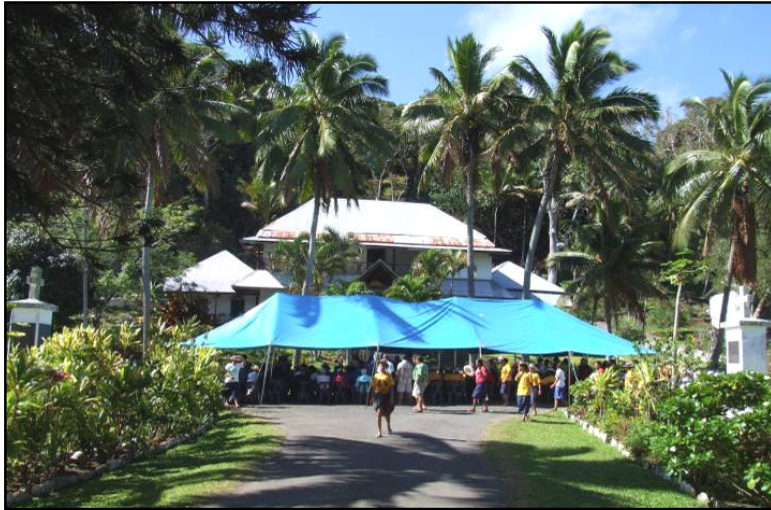
The marquee is up for a special service to mark the commencement of the renovation work to the Mission House, October 2008.