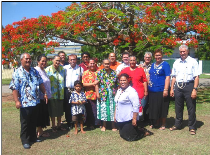
(Some of the Townsville Ekalesia members prior to the team's departure for Brisbane)