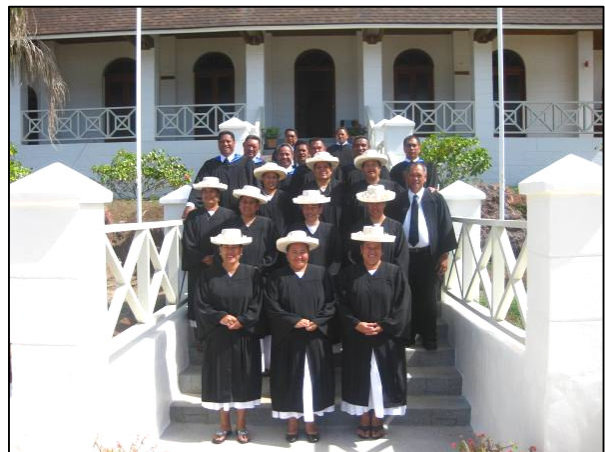
(Left) Looking down from the CICC main office to the Takamoa Theological College graduation site prior to the function, and those graduating (Right)