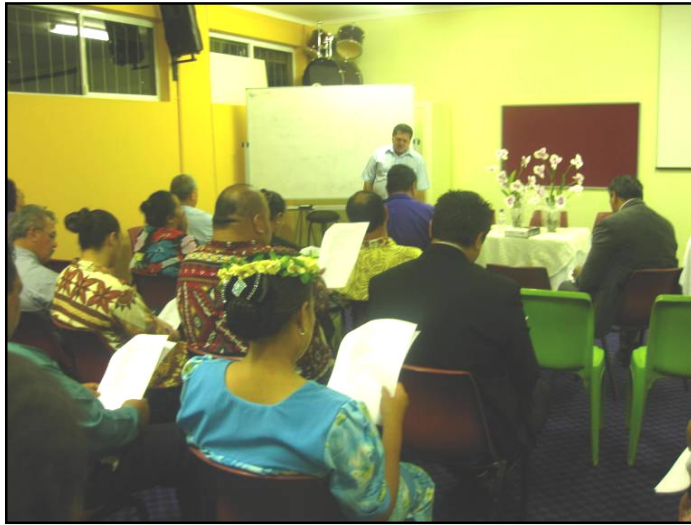
(Some of the Sydney participants in the workshop during the President's presentation)

I muri ake i te pureanga, kua teke atu te katoatoa ki te Marrickville Community Centre no te arikirikianga openga e te orongaanga apinga a nga Ekalesia i mua ake ka aere atu ei te tere ki te pairere i te ai ai no te oki mai ki Rarotonga nei.