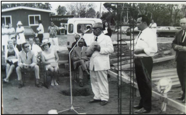
..... and today