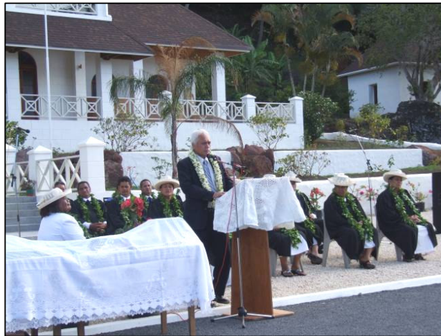
(Prime Minister, Hon. Jim Marurai, addressing the audience)