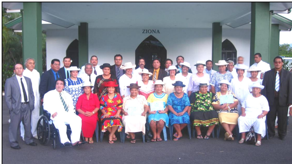
(Some of the members of the Mt. Sheridan and Balaclava CICC branches, Cairns, Australia)

(Kua tataia teia tua tapapa i te tuatau i tere atu ei te kumiti akaaere (President, General Secretary, General Treasurer) ki Cairns i roto ia Noema 2009)